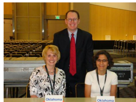
Our OSHP Delegates, smiling as usual!

It was our honor to represent OSHP as elected delegates, and we encourage everyone to become involved in the ASHP professional policy making process.