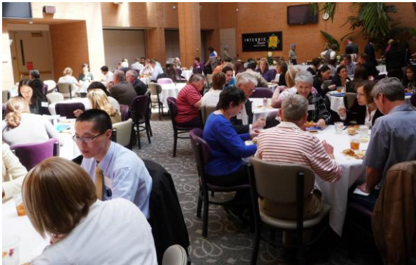
Attendees enjoying lunch