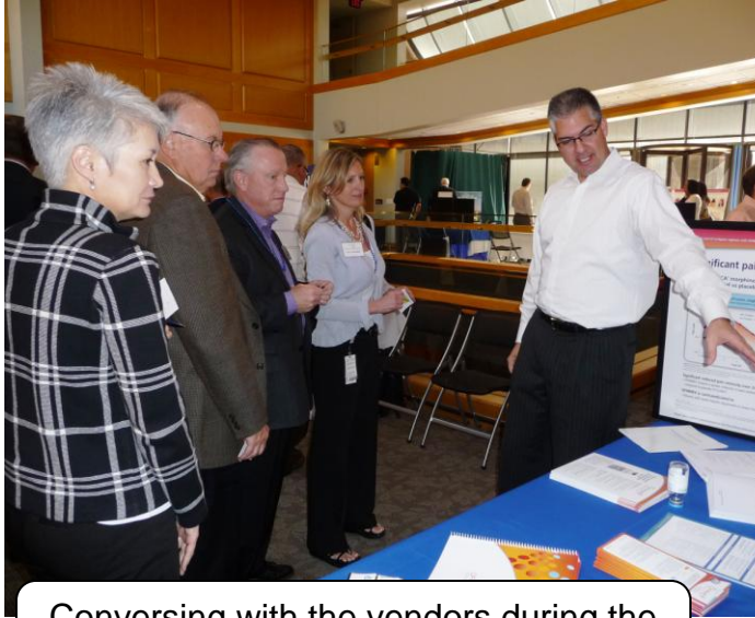
Conversing with the vendors during the Vendors Showcase.